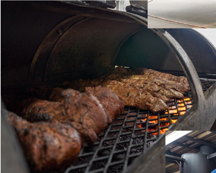
Smokin' Miller BBQ Pit