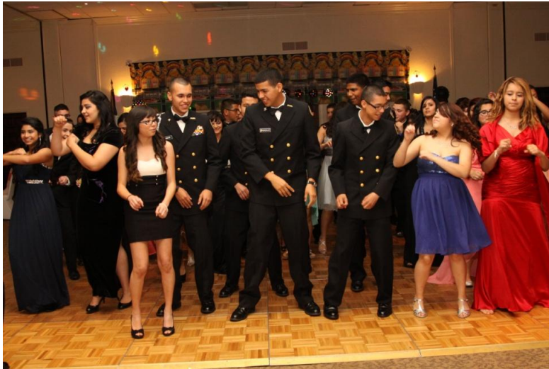
A Ball wouldn't be a Ball without Dancing.

NATIONAL ACADEMIC EXAM: The Academic Teams participated in the National Academic Exam on 19 March. Out of 161 Texas teams, San Benito Team #1 finished in 3 rd Place and Team #2 finished in 25 th Place. Nationally, Team #1 finished 53 rd place and Team #2 finished 328 th place out of 1,713 teams. Since Team #1 beat out Team #2, Team #2 bought the pizza, Team #1 the sodas.