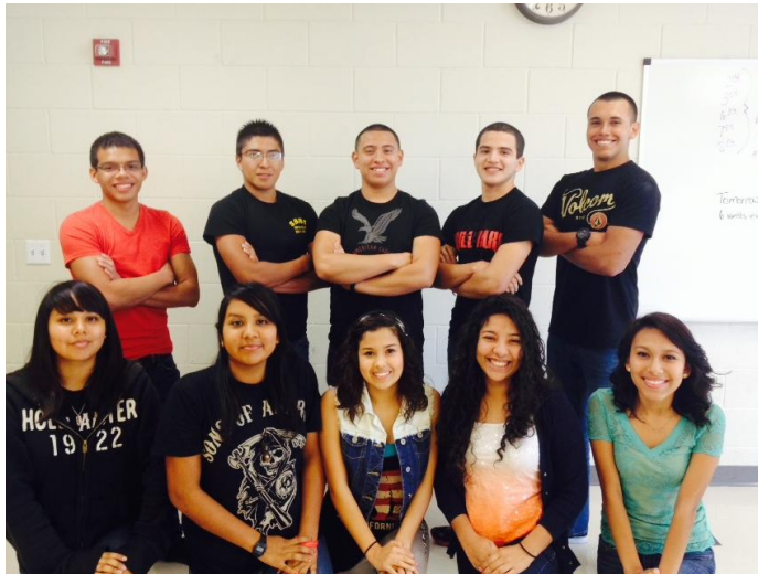
San Benito VMA Academic Teams. Kneeling is Team #1 and Standing is Team #2. Girl Power!

NATIONAL ACADEMIC EXAM: The Academic Teams participated in the National Academic Exam on 19 March. Out of 161 Texas teams, San Benito Team #1 finished in 3 rd Place and Team #2 finished in 25 th Place. Nationally, Team #1 finished 53 rd place and Team #2 finished 328 th place out of 1,713 teams. Since Team #1 beat out Team #2, Team #2 bought the pizza, Team #1 the sodas.