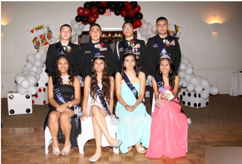
San Benito VMA NJROTC Royal Court.

Couples were announced and walked through an Honor Guard, just prior to going through the Receiving Line.