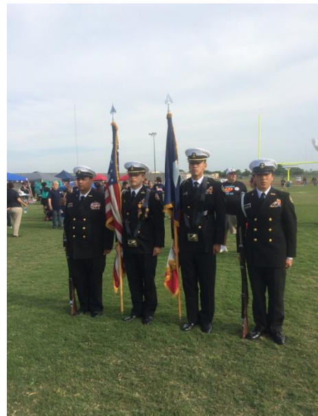
NJROTC Cadets preparing to run at the Relay for Life